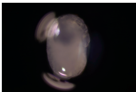
Figure 2. Egg, light microscope (200x)

The image of the egg and larvae (light microscope (200x)) used in the research are shown in Figures 2. and 3.