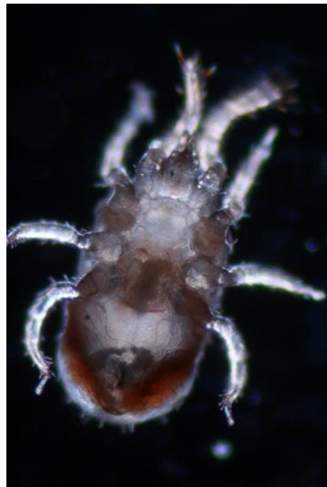
Figure 1. Microscopic image of D. gallinae . The mites get their red colour from freshly consumed blood

Poultry red mite, Dermanyssus gallinae (De Geer, 1778) is an invasive arthropod, successfully adapted to the conditions of modern poultry production (figure 1). Over 80% of commercial layer flocks, as well as parent and breeding flocks are affected by the invasion of this ectoparasite (Sparagano et al., 2009). Its small size (about 1 mm), mobility, ability to feed on a large number of species of birds and mammals, resistance to temperature conditions and starvation (Pavličević et al., 2007b), extreme adaptability and development of resistance, large numbers and high reproductive potential, hidden way of life and night activity (Simić and Živković, 1958) are the traits of this parasite which enable its invasiveness. Poultry red mite is a problem of the flock, but also of the environment, thus jeopardising not just current, but also future flocks (Pavličević et al., 2018b).