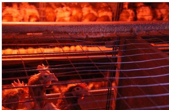
Figure 2. D. gallinae invasion in the clinical conditions of commercial egg production, cage system. Hundreds of thousands of these parasites can parasitise on one laying hen

In addition to biological traits of the parasites, the basis of this health and economic problem is a long-term wrong approach to D. gallinae control, which has been additionally exacerbated by the new changes (EU 1999/74/EC) in the technological conditions of housing layers (Pavličević et al. , 2016a, 2016c, 2019; Flochlay et al. , 2017).